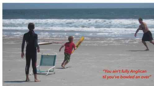
"You ain't fully Anglican til you've bowled an over"